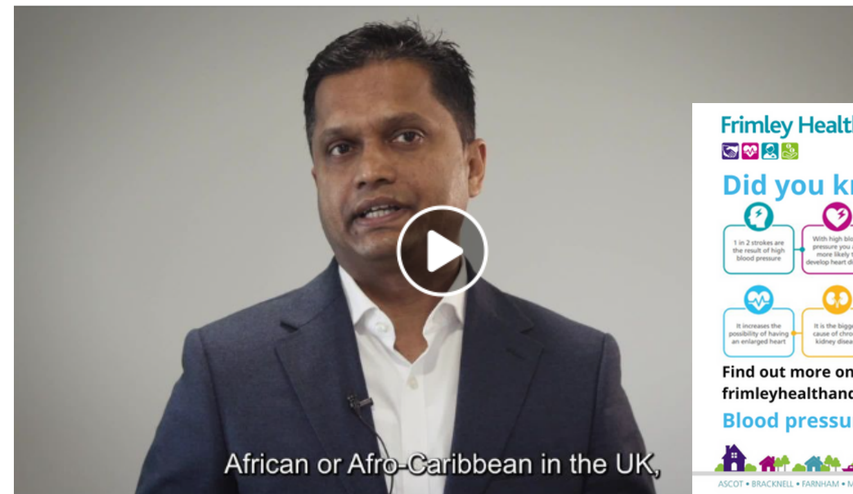
African or Afro-Caribbean in the UK,