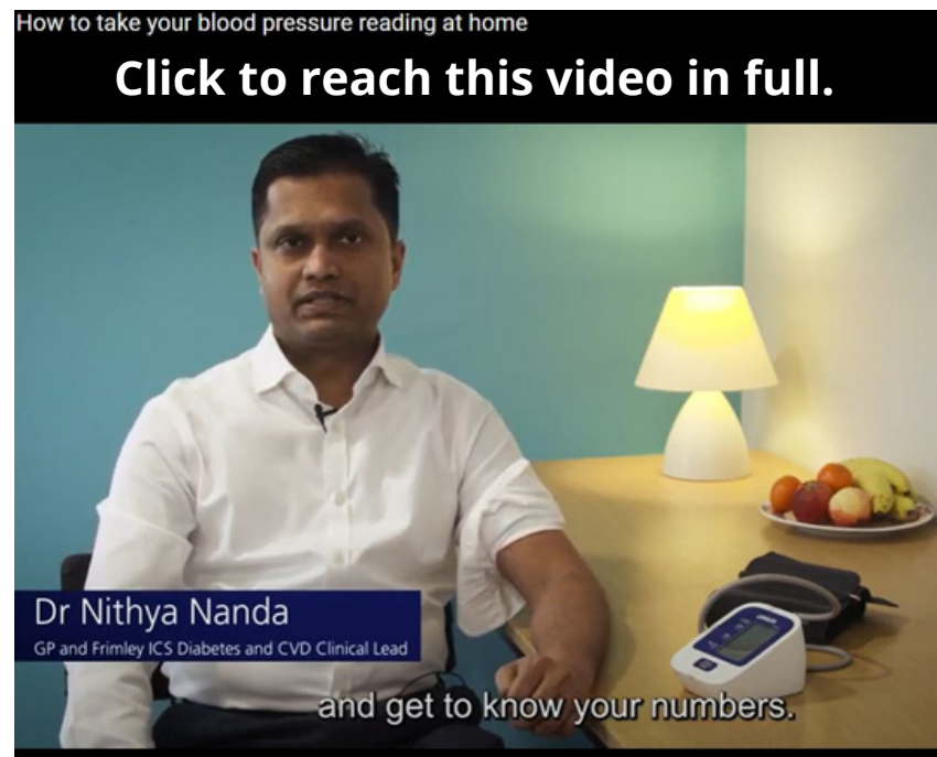
Informative video with a local GP

We have developed a bespoke webpage www.frimleyhealthandcare.org.uk/bloodpressure